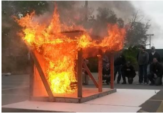
New England Fire Investigation Seminar

Students presented at both on- and off- campus conferences in recent years: